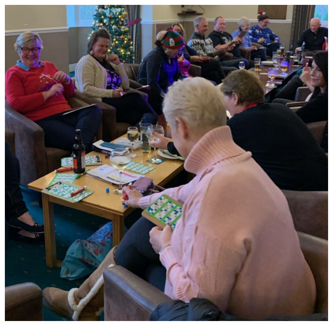
Eyes down for a single line followed by a full house!!